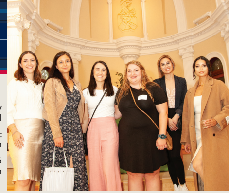
Top Right: Alumnae in Holy Name Chapel

The day concluded with guests enjoying refreshments and sentimental tours of the school. Homecoming brought together over 350 people.