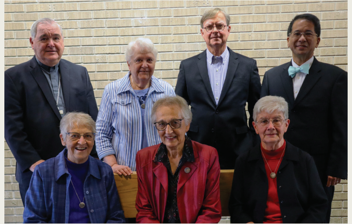
St. Mary's Academy Stewardship Current Members

On September 11, 2022, the SNJM gathered in Holy Names Chapel to release their longstanding ministry and offer prayers for the school to carry on in the spirit of Blessed Marie-Rose Durocher, the foundress of the SNJM.