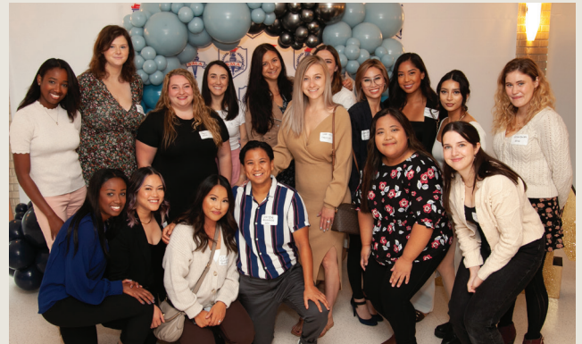
Class of 2012: 10th Reunion