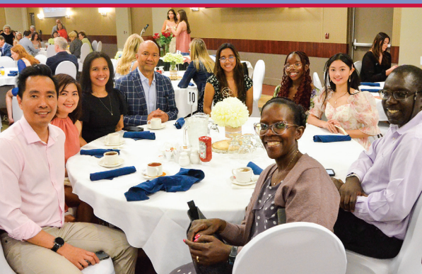
Bottom photos, l-r: Graduate/Family Brunch, Graduation Dinner and Dance