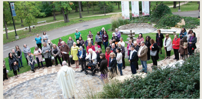
Unveiling and Blessing of the Legacy Rose Garden