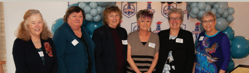
Class of 1977: 45th Reunion