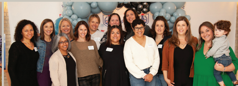
Class of 1997: 25th Reunion