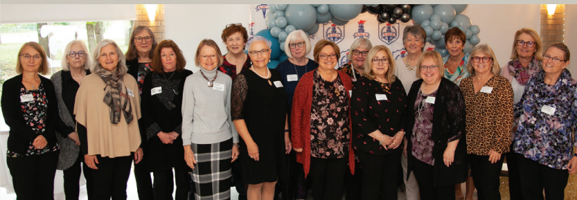
Class of 1972: 50th Reunion